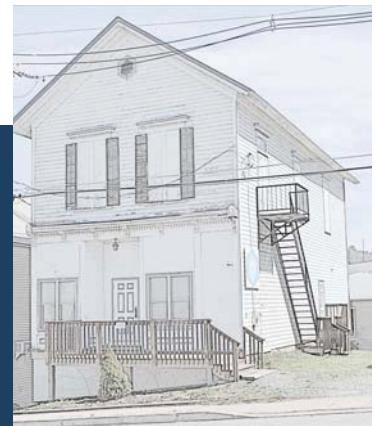
Lodge Hall on Church Street