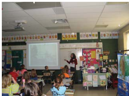
In-school programs for Veterans Day and third grade classes