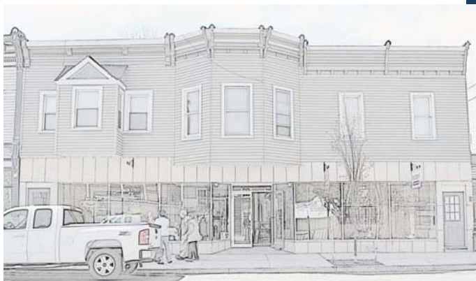
25 Main Street

Creating a new home for community memories