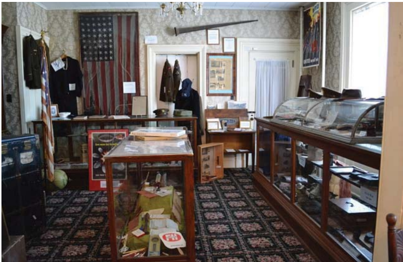
Wyalusing Valley Museum exhibits in our current location